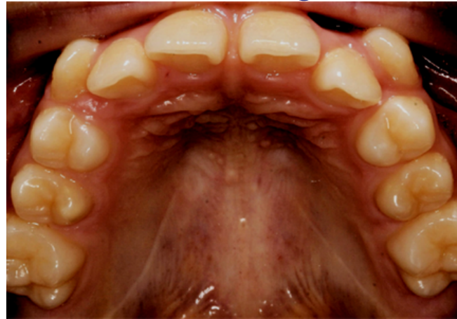
Extreme Crowding Before Treatment