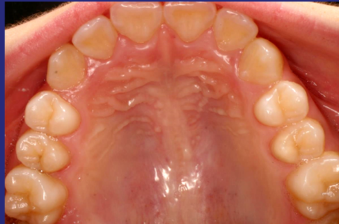
After treatment, no extractions needed.

Do you suffer from any of these symptoms?